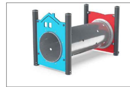
⑤ PEEKABOO TUNNEL

Order No: 3.41000 Supplied by Richter Spielgerate or similar and approved. Slide, Socialize, Sensory, Dramatic Play Dimensions LXWXH: 3450x3450x7000cm