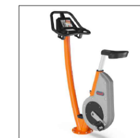
⑩ CITY BIKE