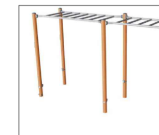
⑬ DOUBLE OVERHEAD LADDER