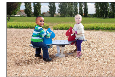
⑦ PONY SEESAW

Product No: M951 Supplied by Kompan or similar and approved. Balance, Jump, Swing, Socialize, Sensory, Inclusive Dimensions LXWXH: 125x37x137cm