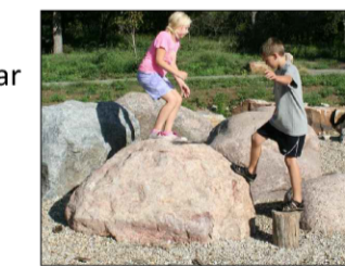
⑪ NATURAL PLAY BOULDERS

1. CALEDONIAN MIXED GLACIAL BOULDERS 2. SMOOTH AND ROUNDED WITH NO SHARP EDGES 3. LOW LEVEL BELOW 1M 4. SUITABLE FOR SEATING AND CLAMBERING IN ANY PLAY AREA 6-12 YEARS AGE RANGE