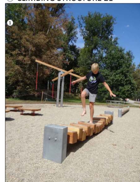
③ BALANCE BLOCKS

CLIMBING STRUCTURE 21 Supplied by Richter Spielgerate or similar and approved. 1. MOVEMENT: CLIMBING, BALANCING, DOING 2. INCENTIVE FOR PLAYING: STRONG, CHALLENGING, BALANCING, DOING EXERCISE. Order No. 6.51021