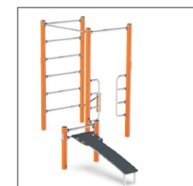
⑨ COMBI 2

1. PLAY TREE TRUNK 2. TREE TRUNKS OFFERED IN 3 DIFFERENT SIZES 3. LOW LEVEL UNDER 1M 4. SUITABLE FOR SEATING AND CLAMBERING IN ANY PLAY AREA 5. 6-12 YEARS AGE RANGE