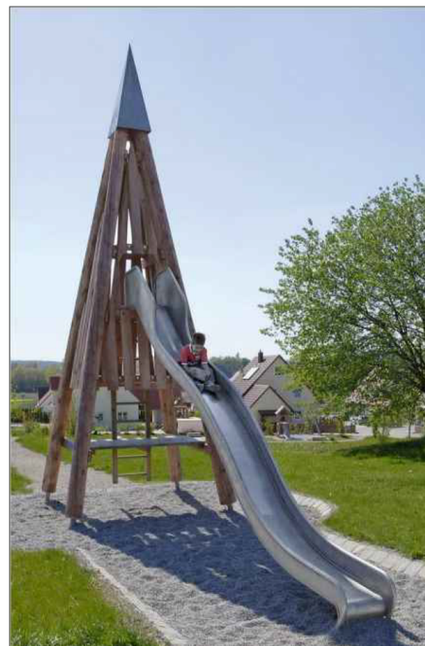
④ SMALL PYRAMID TOWER

BALANCE BLOCKS, END FRAMES OF HDG STEEL Supplied by Richter Spielgerate or similar and approved. 1. MOVEMENT: CLIMBING, BALANCING, DOING 2. INCENTIVE FOR PLAYING: STRONG, CHALLENGING, BALANCING, DOING EXERCISE. Order No. 6.51021