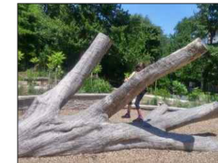
⑧ PLAY TREE TRUNK

Product No: M190 Supplied by Kompan or similar and approved. Balance, Rock, Socialize, Sensory, Dramatic Play Dimensions LXWXH: 42x118x60cm